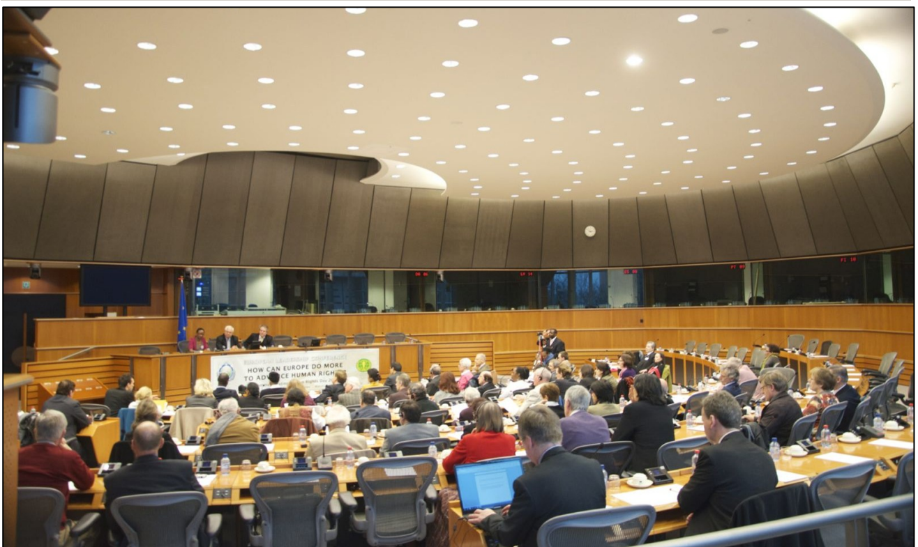
European Parliament, where the final 2 sessions of the conference were to take place

(Celebrating U.N. Human Rights Day 2012)